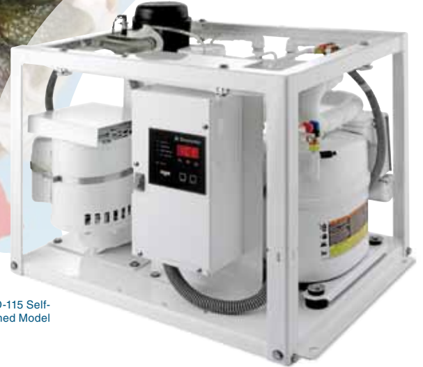
EI600D-115 Self-Contained Model

Crushed ice—preferred by fishermen—cools more quickly and packs better. A Dometic Eskimo Ice system produces up to 600 pounds (272 kg) of crushed ice per day to keep even the largest catches fresh. Ice is generated within minutes after starting the unit, and makes up to 25 pounds (11.3 kg) of ice per hour under normal operating conditions.