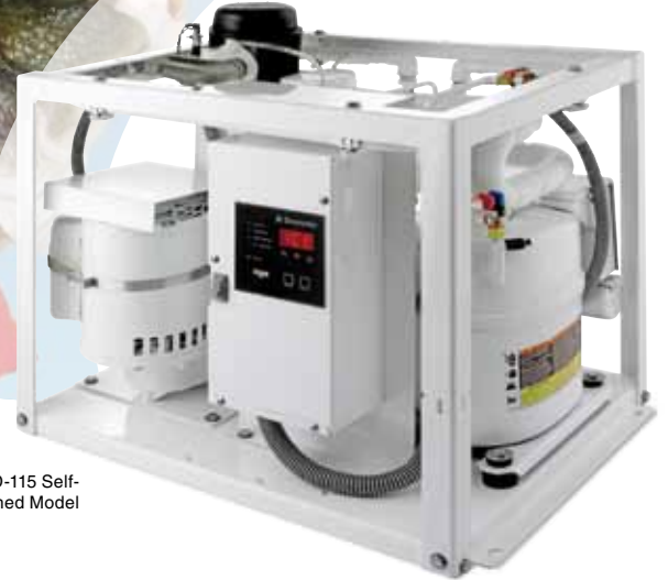
EI600D-115 Self-Contained Model

Crushed ice—preferred by fishermen—cools more quickly and packs better. A Dometic Eskimo Ice system produces up to 600 pounds (272 kg) of crushed ice per day to keep even the largest catches fresh. Ice is generated within minutes after starting the unit, and makes up to 25 pounds (11.3 kg) of ice per hour under normal operating conditions.