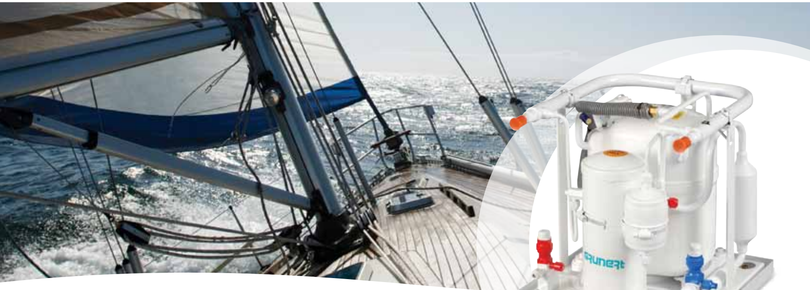
Passagemaker AC450 model shown

Grunert Passagemaker compressors are hermetically sealed for quiet, efficient operation. Vibration isolators are incorporated in all mounting platforms to provide additional noise reduction.