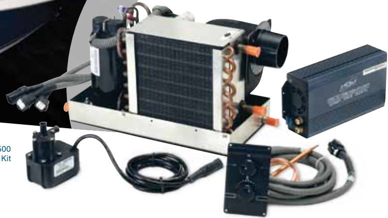
Cuddy dc 3,500 BTU/hr Kit

The Dometic Cuddy dc is a compact 3,500 BTU/hr cool-only air conditioner designed to work with 12V power systems. Energized by a dedicated bank of batteries and a dedicated power module (DPM), the Cuddy dc makes your small cabin a refuge from the heat and sun. Compact—about the size of a typical battery box—this low-profile unit easily fits beneath a V-berth or in a storage area below deck. The Cuddy dc uses R-134A, a globally accepted, environmentally safe refrigerant.