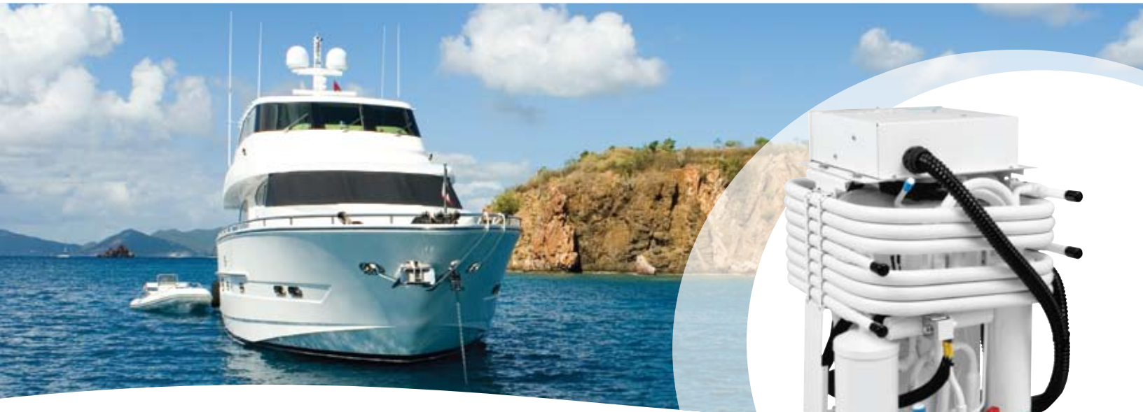
CSD36R condensing unit shown

The CS series of multi-ton condensing units provide heating and cooling ability in a highly efficient package. The hermetically sealed, high-efficiency compressor reduces amp draw, while pressure switches, thermal-overload and start components provide constant system protection and proper operation. In addition, the expansion device and check-valve assemblies control load balancing during operation. The system's copper-encased cupronickel condenser coils are highly resistant to corrosion that can be caused by continuous seawater flow.