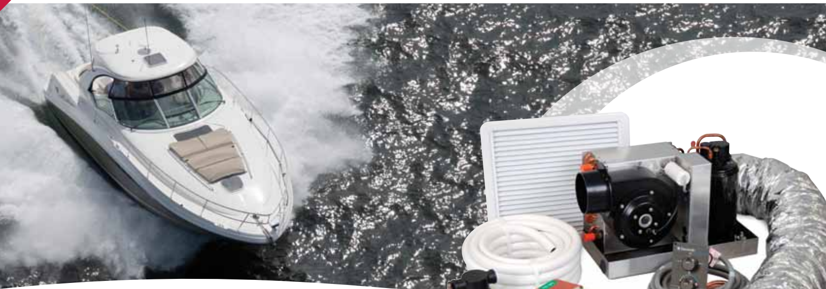
Dometic EnviroCool 5,000 BTU/hr Kit

Enjoy ideal temperatures in your boating environment with Dometic's EnviroCool Series of marine air conditioning kits. The EnviroCool Series offers a wide range of BTU capacities from 3,500 to 15,000 BTU/hr to allow you to size your system for ultimate cooling. The EnviroCool series uses environmentally safe R-134A (3.5K BTU/hr. model) and R-417A (5K - 15K BTU/hr. models) refrigerants.