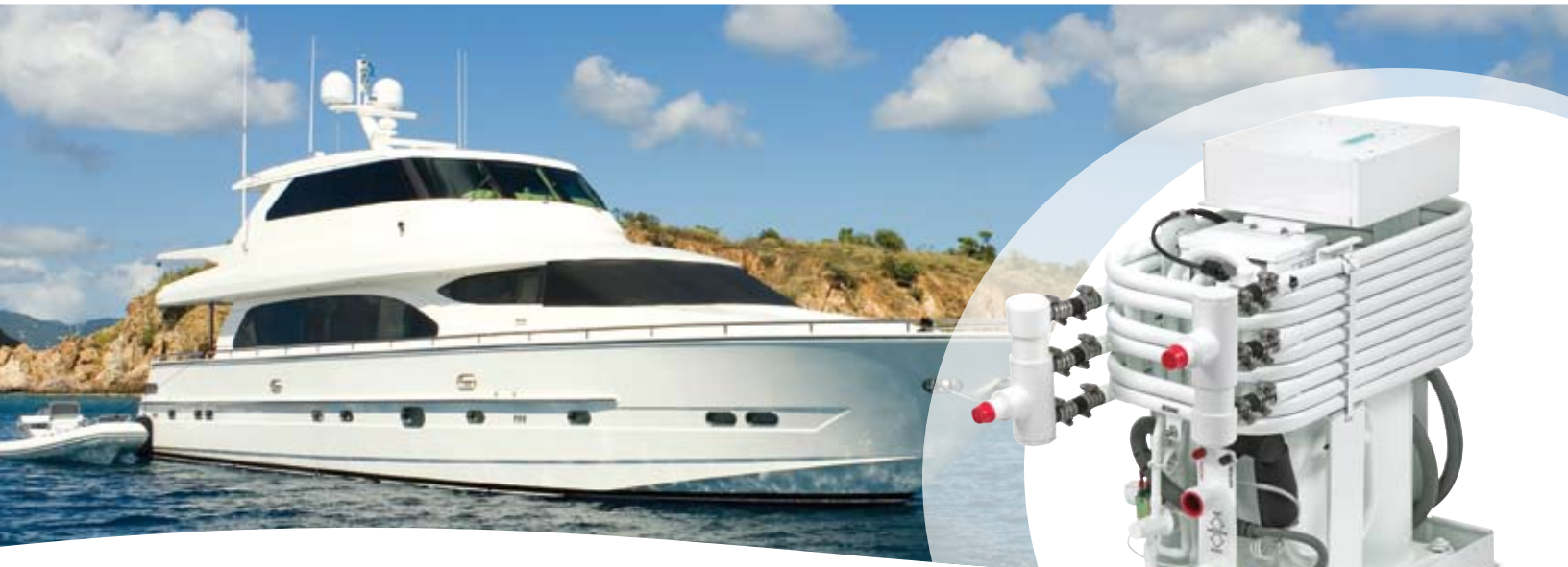
MCW 5-Ton shown

Modular chilled water (MCW) units are available in capacities ranging from 24,000 to 180,000 BTU/hr. MCWs are available in single phase or three phase, 50Hz or 60Hz, and all standard voltages (208, 230, 380, 460 VAC). Modules can be staged together to provide a larger system, which is easily retrofitted and serviced in the field. A maximum of six 15-ton stages could be configured for a total of 1,080,000 BTU/hr or 90 tons. Each refrigerant circuit is hermetically sealed and factory pre-charged with R-22 refrigerant (407C is optional). Each condensing unit is monitored and protected with freeze controls, high limit switches, high and low aquastats, and timers. These condensing units can be installed in any convenient location and are unaffected by vibration, moisture or ambient temperatures up to 140°F/60°C.