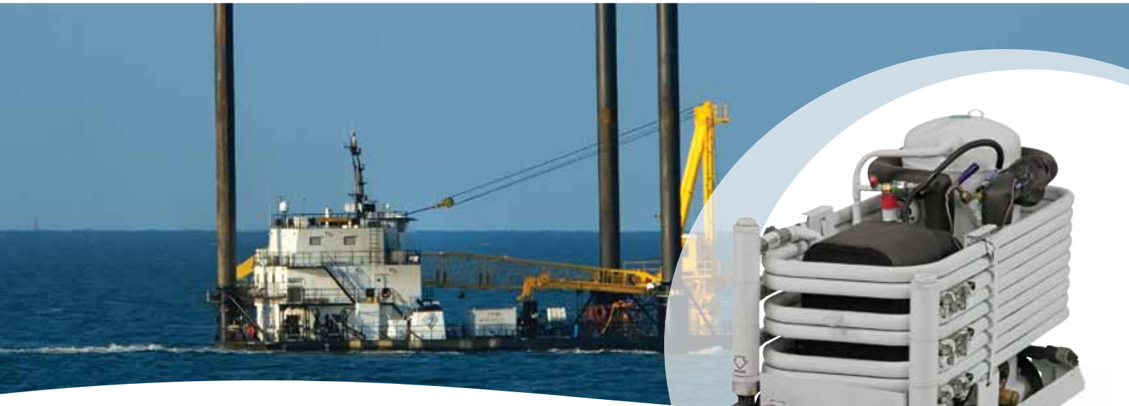
MCW-LP chilled water system shown

Dometic Marine's MCW Low-Profile Chiller is designed for locations onboard where height is an obstacle. At 18.25" (464mm) tall, it's about 20 percent shorter than other chillers in its capacity range, but no shorter on high performance and reliability.