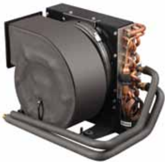
Emerald TurboVap 12K unit shown with optional lineset extensions.