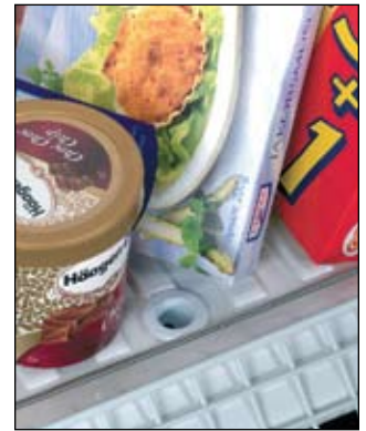
■ Condensation drain.