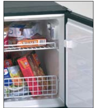
■ Easy to clean plastic interior.