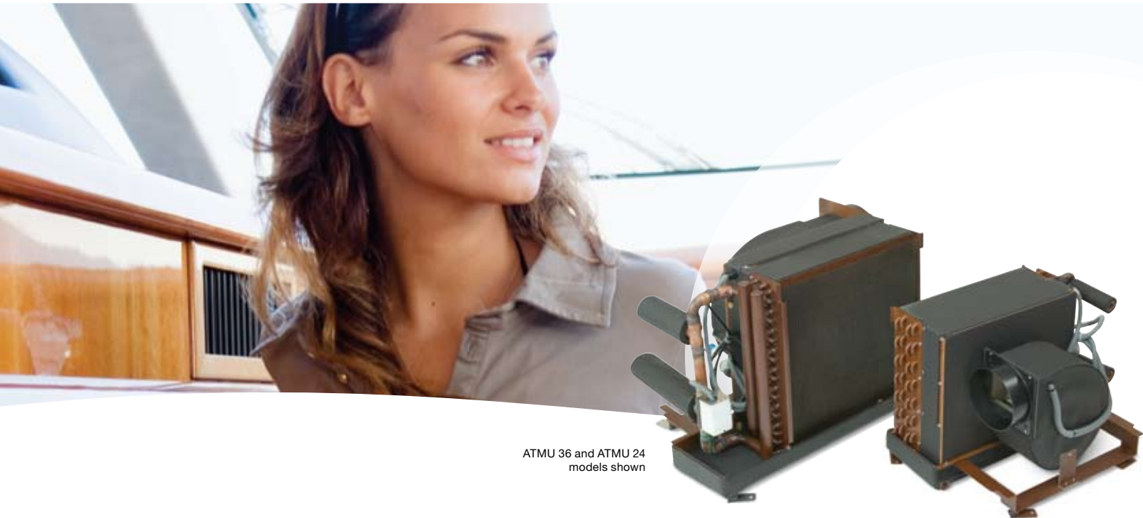
ATMU 36 and ATMU 24 models shown

AT-MU air handlers are designed for use in fresh air make-up (FAMU) systems where outside air is drawn in by the air handler, cooled, dehumidified, and reheated to room temperature, and then ducted to various areas in the vessel.