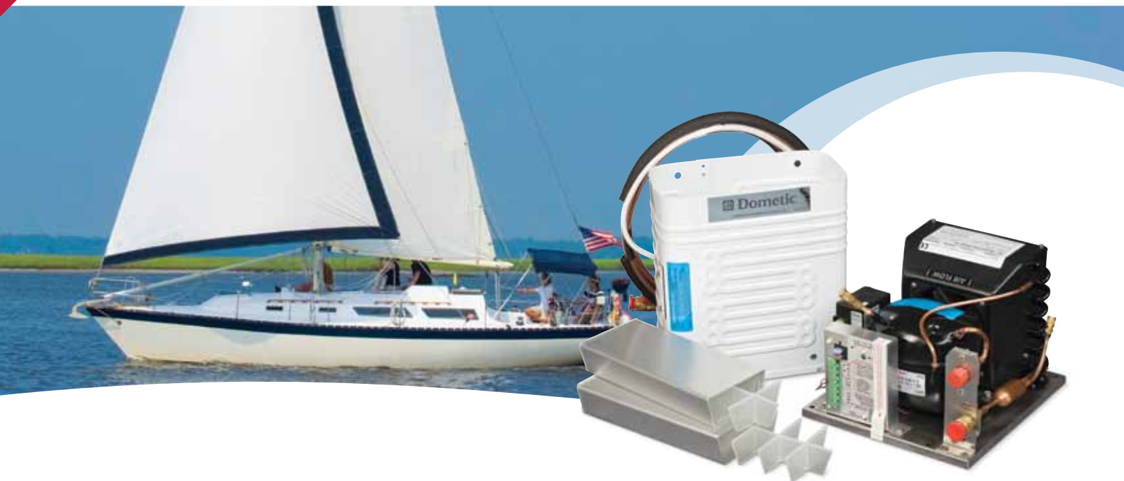
CU-100 ColdMachine & VD-150 Evaporating Unit (shown with ice trays)

Performance, efficiency, and quality are hallmarks of Adler/Barbour ColdMachine Kits by Dometic. Two configurations are offered: The air-cooled CU-100 ColdMachine, and the air- and water-cooled CU-200 SuperColdMachine. Powered by a Danfoss BD50F compressor, these easy-to-install units provide up to 15 cu. ft. (424 liters) of refrigeration and work with a variety of 100-Series evaporators (see reverse side).