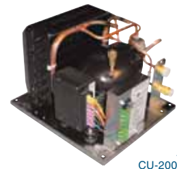
Adler/Barbour CU-200 ColdMachine